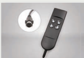
75008 Proline 4 Button